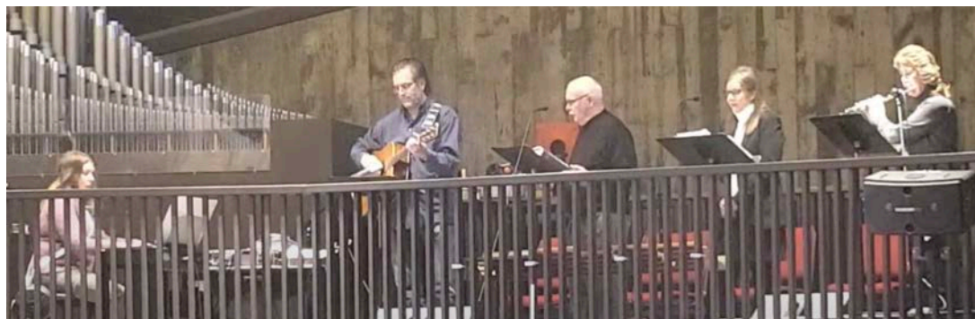
Musicians & Choir