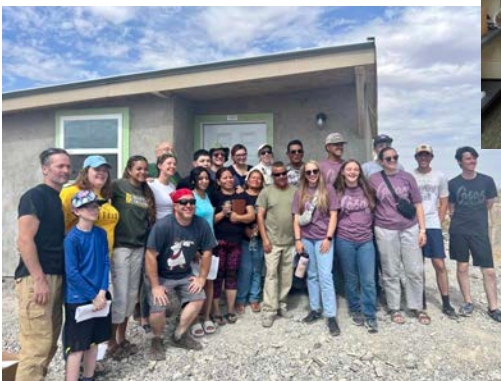
Youth Mission Trip