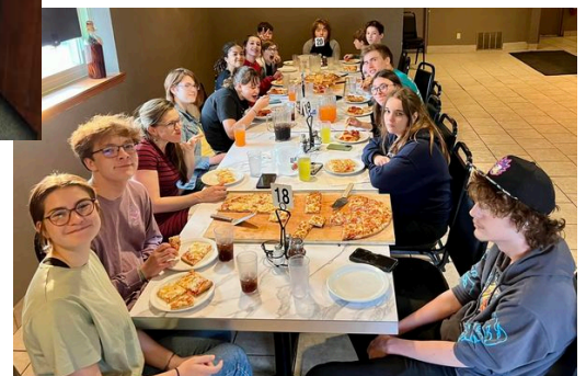
D-Groups (Discipleship for Youth)