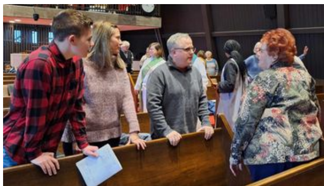
Passing the Peace