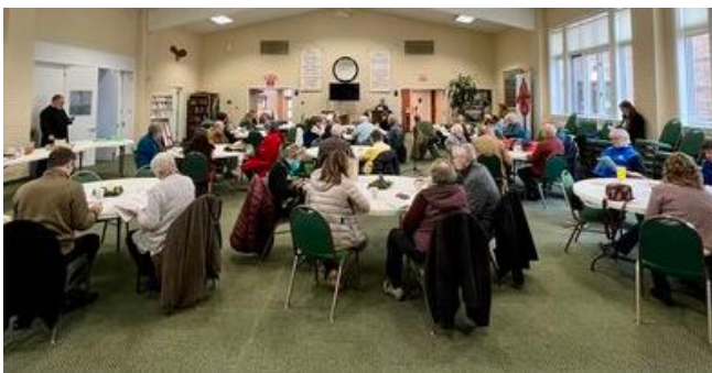
Discussion about our future

The Church is changing, and the culture around us is changing. We look forward to the perspectives and experiences our next Rector will bring to our St. Thomas family. Engaging in the next chapter at St. Thomas is exciting and we hope to bring a willingness to see what God is doing and gracefully develop a partnership with our next Rector that will strengthen the faith and spirituality of our St. Thomas community and our Rector.