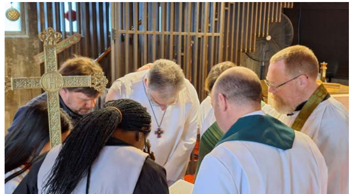
Prayer after a service

St. Thomas is a faithful, passionate community of Christ followers located in Neenah-Menasha, Wisconsin. We draw worshippers from roughly a 50 mile radius (in person) and from many parts of the world (virtual). With active involvement in many diocesan events and leadership positions, we are the largest congregation in the Diocese of Fond du Lac. We are the third largest Episcopal church in the state of Wisconsin.