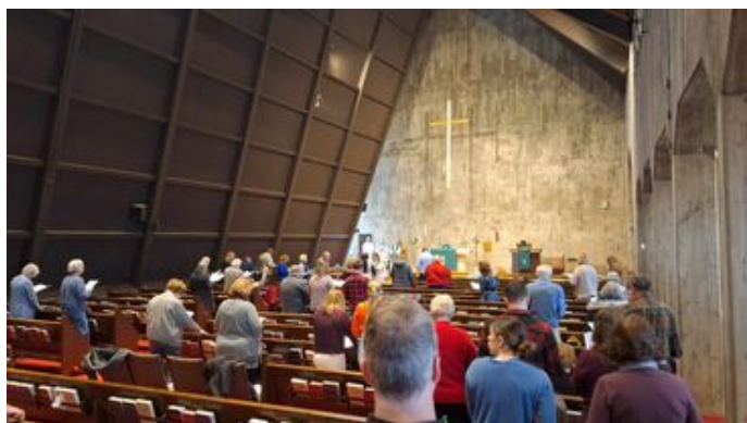
Sunday 10am service

Sundays bring an opportunity to worship together using either Rite 1 at 8am (no music) or Rite 2 at 10am with choir and music. We approach liturgy from a broad church perspective. Adult Education, Children's Sunday School and Film School for our teens occur between the services. Coffee hour follows the 10am service. After services, our youth may then be off for a fun activity or service work with our associate priest/youth minister.