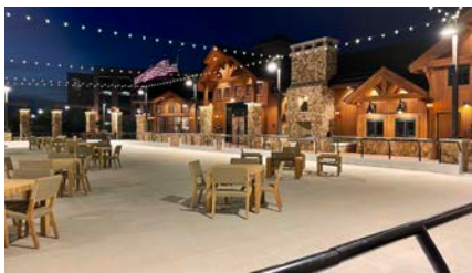
The Plaza downtown Neenah

While both Neenah and Menasha remain relatively homogenous in the way of ethnic diversity, each boasts vibrant and proud minority populations. The cities have seen population growth of 5-7% in the last decade. The median household income is about $61,000. Roughly 10% of both the Neenah and Menasha populations are living at or below the national poverty level. Thus, there is a significant portion of our community in need of care, attention, and support to meet basic needs. St. Thomas seeks to continue serving these members of our community both in and outside the walls of our church.