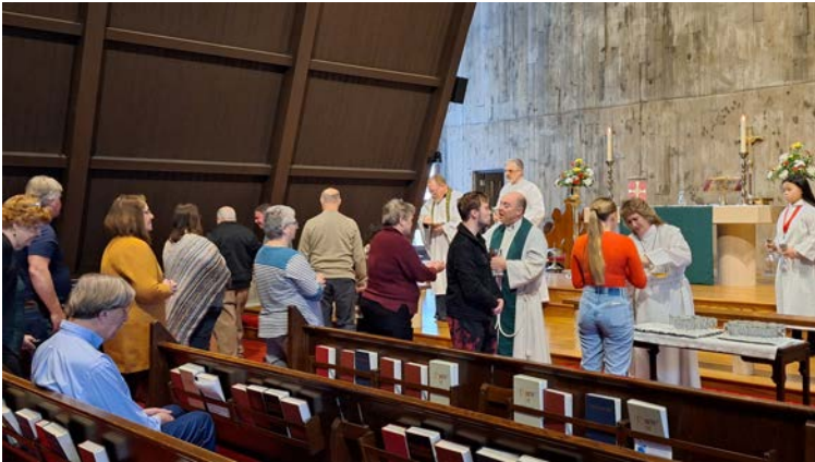
Distribution of Communion