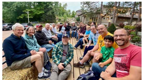
Fellowship Weekend Hayride

You Are Now Entering The Mission Field. God is with You.