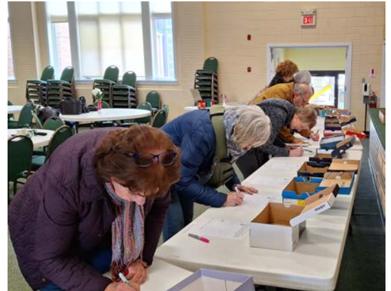
Care packages for college students