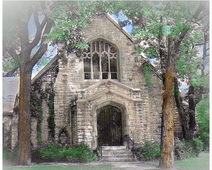
1915 St. Thomas Church

The community of St. Thomas Episcopal Church started its beginning as a family of Christ 164 years ago. St. Thomas has benefitted from the stability that comes with the longevity of ministry. We have had only four rectors in the past 67 years. Many replacements and renovations have led to our current building, an impressive blend of two architectural periods. Its majestic sweeping curved roof resembles a ship under sail and its spectacular copper steeple allows us to bring our thoughts upwards. Preserved stained glass windows and the altar from the original building remind us of the grace of God. Symbols of unity abound and speak to our shared Creed and our Savior.