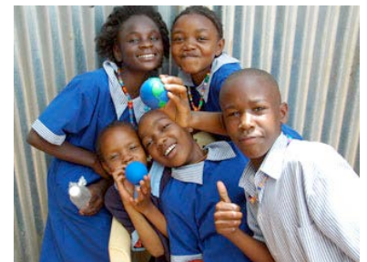
Mother's Mercy Home, Kenya